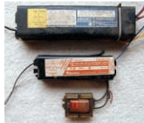
Typical magnetic Ballasts